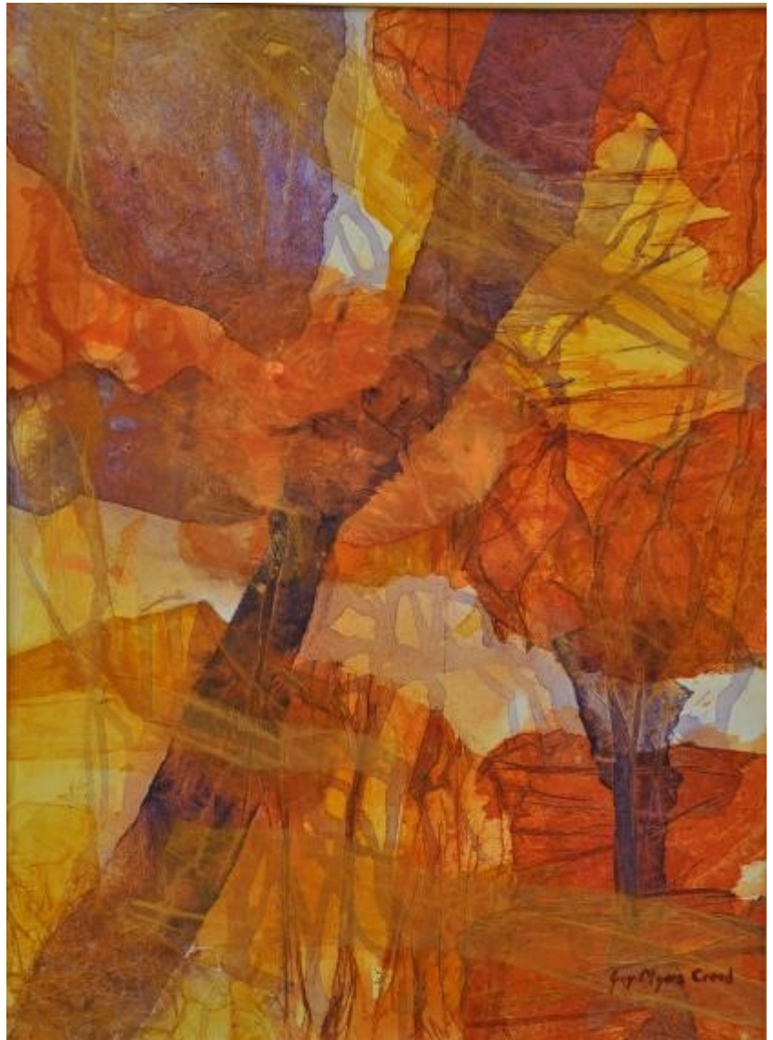
Art Work by Joy Myers Creed

When you draw a tree, you must feel yourself gradually growing with it.