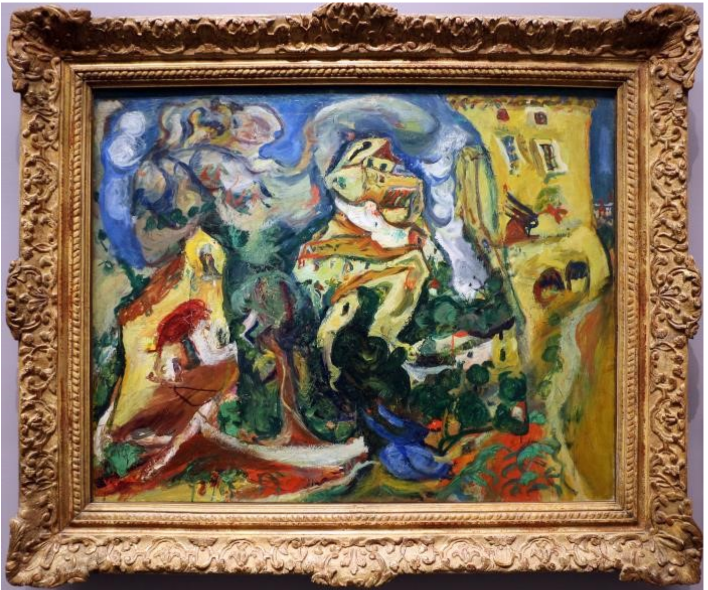
Chaim Soutine, il villaggio, ca.1923

Then I found Matisse, the concept he held that there two types of light – an outer light for those who need security, and an inner light for those who want to develop their innate freedom and find personal expression in the hand. This was linked to the divine, as it requires a letting go of the ego.