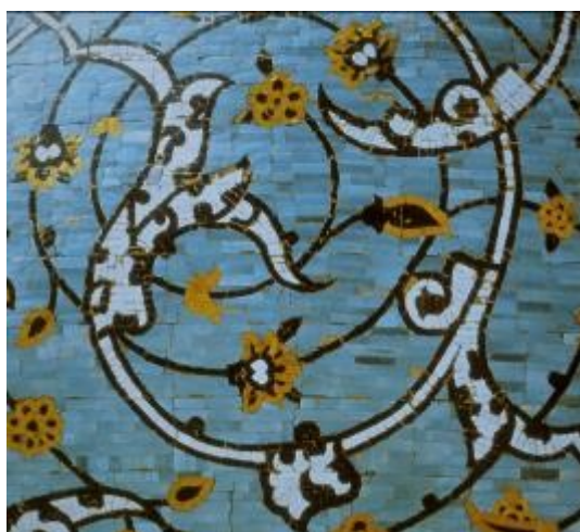
Tiles on the dome of Shaikh Lutfullah Mosque in Esfahan, Iran

Tiles have been purchased and all members and class participants are asked to decorate them with underglaze, eventually to be displayed on our new brick walls.