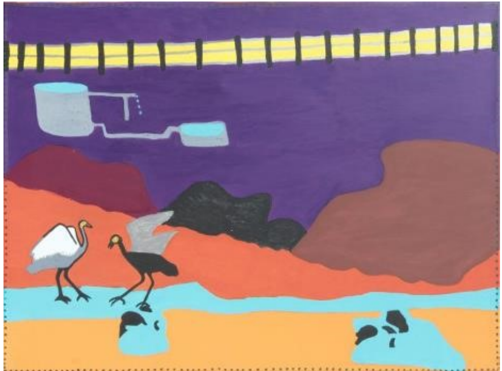
Between the Fence and Freedom