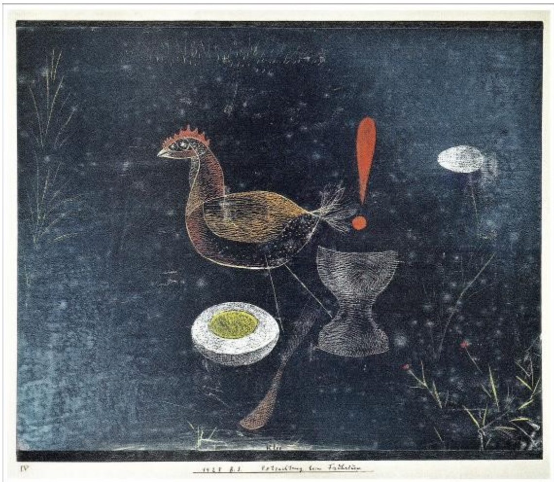
Paul Klee, 'Contemplation at Breakfast' (1925)