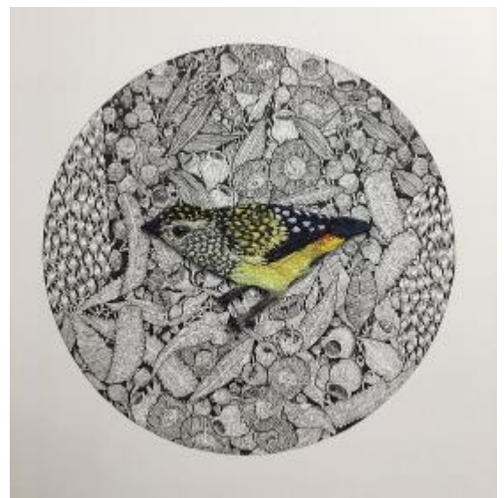
A Highly Commended award went to Jack Buckley (embroidery on drawing)