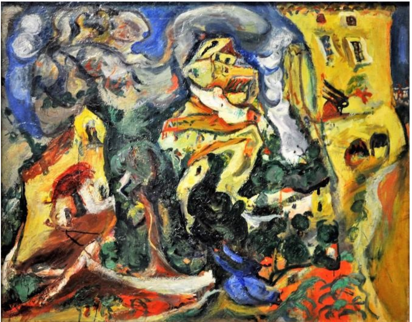
Chaim Soutine, Landscape at Cagnes (La Gaude) c. 1923

Like him we could follow our star to the end and shun the pressures of fashion, the doing of "should" instead of following our true likes and needs that our real personalities long for.