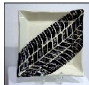
Andrew Garnett Road toll