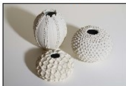
Bronwyn Campbell Butterfly eggs