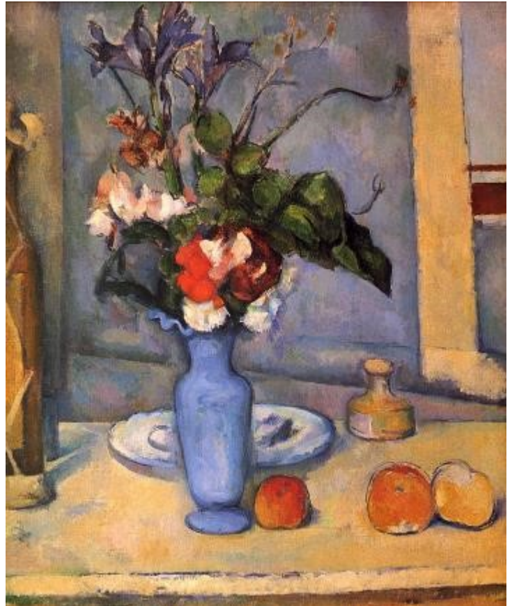
Paul Cezanne, The Blue Vase, 1889 oil on canvas, 61 X 50cm

The restless eyes that dart and wander, the ropes and nerves that twist and turn in image of the world's distorted ways, the eyes that gaze in solitary pain through light that bites like acid at the face of things, find here their resting place. A blue vase on a table before a wall of blue drawn taut by planes; the soft curves of its shimmering form begin a fragrant song that in rich tones rises through leaves and flowers heavy with life. Irises raise their delicate purple heads above the crowd; thick textured leaves add green shades of darkness; cyclamen dance like butterflies about the vase, never landing, white wings beating back the light; and edible, ecstatic, more fruit than flower, are four balls of pure, burning red: this is the centre, the triumph over death.