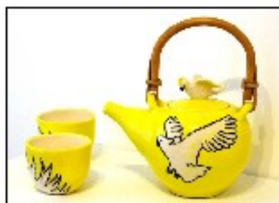
Bronwyn Campbell Cockatoo tea pot