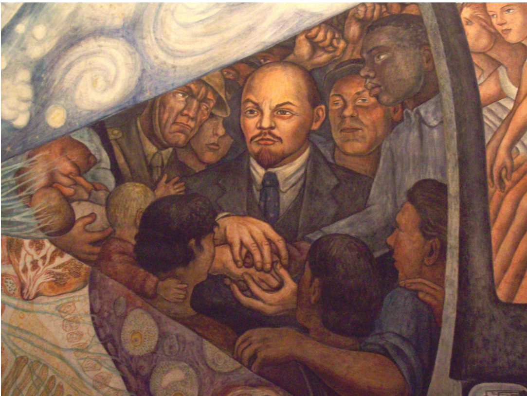
Diego Rivera, The Controversial Rockefeller Mural