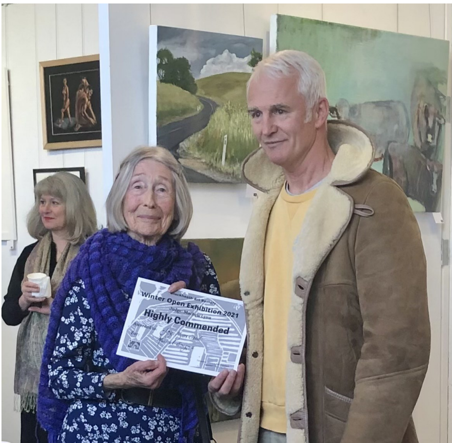
One work of Joy Myers Creed was highly commended.